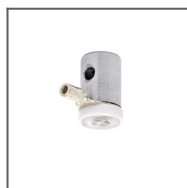
BZP-ZZ Head Ref: 42215