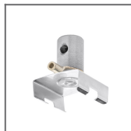
45-ZZ Head Ref: 42212