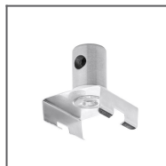
45-ZO Head Ref: 42211