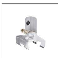
ZZ Head Ref: 42218