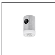
BZP-ZO Head Ref: 42214