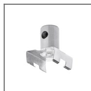
ZO Head Ref: 42217