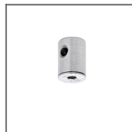
BZP Head Ref: 42213