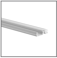
POLI Profile Ref: B7176