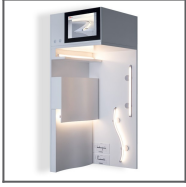
Display P230-90083M Ref: 90083M