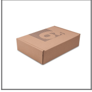
Presentation set 6 Ref: 90125