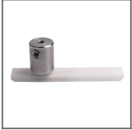
MULTI Fastener Ref: 00214