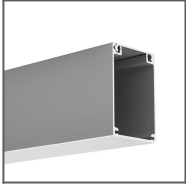
BOX Profile Ref: 00640