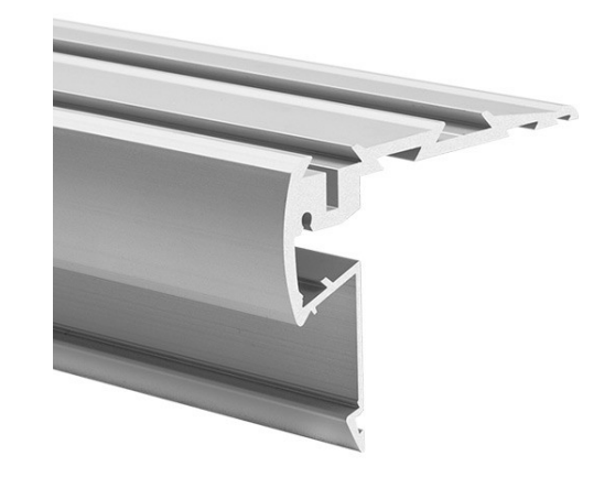
Fill empty fields